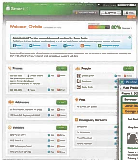
What citizens create...